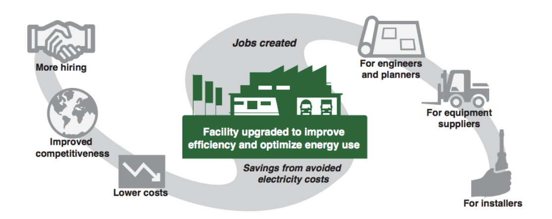
Figure 3. How energy efficiency creates jobs

As figure 3 shows, energy efficiency creates jobs and lowers energy costs across many domestic industries. When energy efficiency measures are installed, whether through government incentives or private sector investment, they create a demand for skilled labor. Efficiency projects not only require skilled craftspeople to build and maintain projects, but they also need teams of planners, engineers, and financiers to execute and complete them.<sup>4</sup>