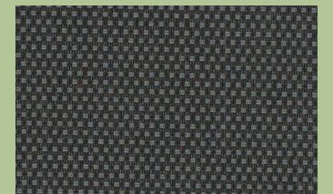
Fabric Model #: S3001-E-3